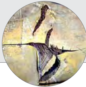
Excessive Cover Damage